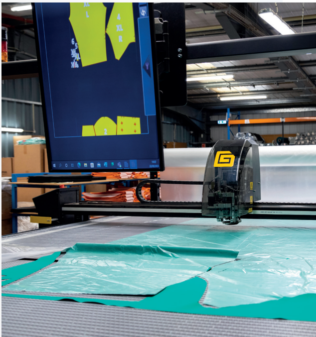
^ UK manufacturing

“ The level of quality and safety offered by the protective clothing we now supply our workforce with, from Globus Group, surpasses our previous solution in terms of comfort and longevity. The fabrics exceptional quality and the garments construction have far exceeded our initial expectations, ” remarked Steve.