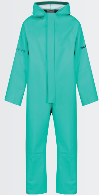
^ The solution: Skytec ChemSol

In response, Steve collaborated with Globus Group to find a new PPE solution. Dedicated to proactively tackling potential concerns and swiftly achieving a resolution, Steve with a Globus Group representative conducted a comprehensive assessment of current PPE.