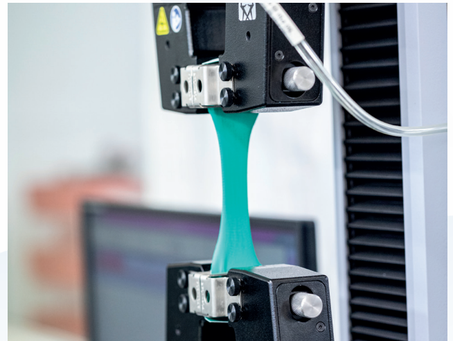
^ Inhouse material testing

“ Furthermore, the fact that these garments are manufactured here in the UK has further enhanced our commitment to environmental sustainability, ” he added.